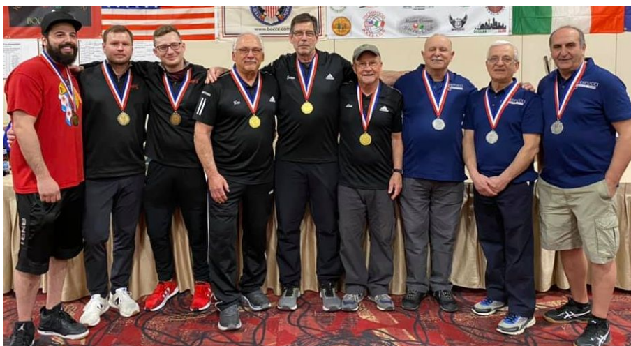
Winners from the Las Vegas National Open Bocce Tournament