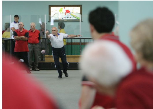
2010 United States Bocce Championship at the italia-America Bocce Club in St. Louis

For all of the details visit www.usbf.us